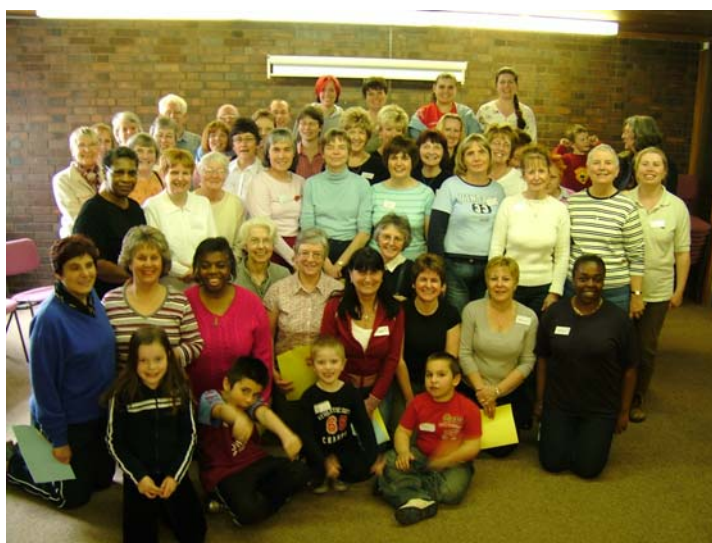
BCCM students 2004 - 2005

We particularly want to encourage Young Leaders to attend and would welcome anyone from age 16 to join the programme.