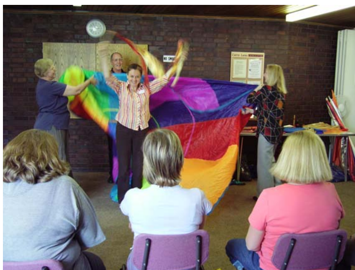
BCCM students storytelling 2006