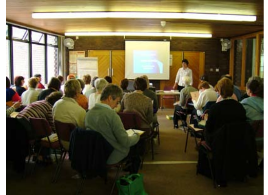
BCCM students 2006

How to build and keep an enthusiastic children's team and develop positive relationships between children and adults in your church.